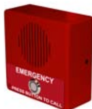
Emergency Intercom #011035