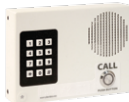
Wall Mount Keypad #011113