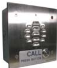
Outdoor Intercom #010935

The following Intercom models are also available: