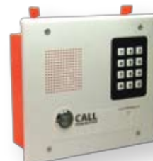
Flush Mount Keypad #011123