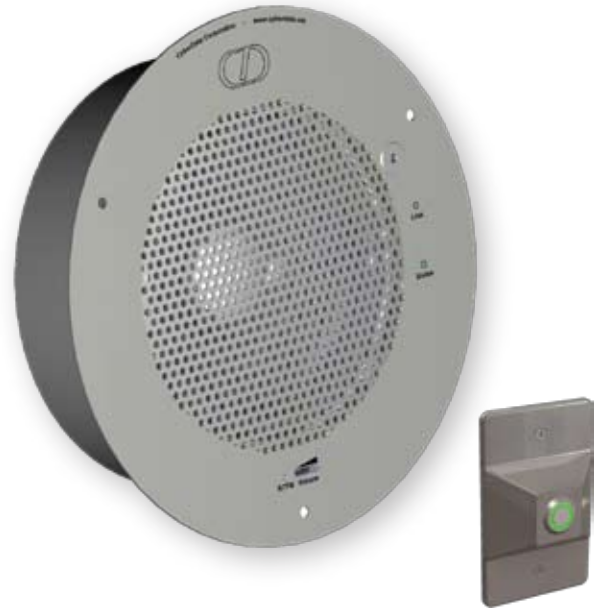
Optional remote call button: 011184, RAL 9002 011185, RAL 9003

By use of the optional remote call button, calls to a predetermined extension can be initiated from the room with the speaker. During the active calls, the LED light on the switch can be programmed to blink to show call activity.