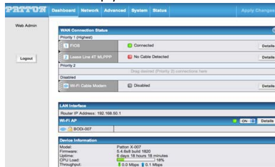
Figure 3. Web Admin Interface home page

The Web Admin Interface Dashboard shows the current WAN, LAN, Wi-Fi AP settings and statuses. The Dashboard enables you to change the priority of the WAN connections and switch the Wi-Fi AP connections off or on. For more information about configuring these connections, refer to Chapter 3 in the BODi rS BD007 and BD004 User Manual : ( www.patton.com/manuals/BD007_BD004.pdf ).