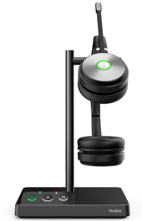
WH62 Dual Teams WH62 Dual UC

Based on 100+ headform evaluations and 1000+ wearing comfort tests, WH62 well meets the ergonomic requirements. Besides, with premier soft leather cushions and lightweight design, you can wear it all day comfortably. For more workspace freedom, WH62 can also free you up to 160m away from the desk.