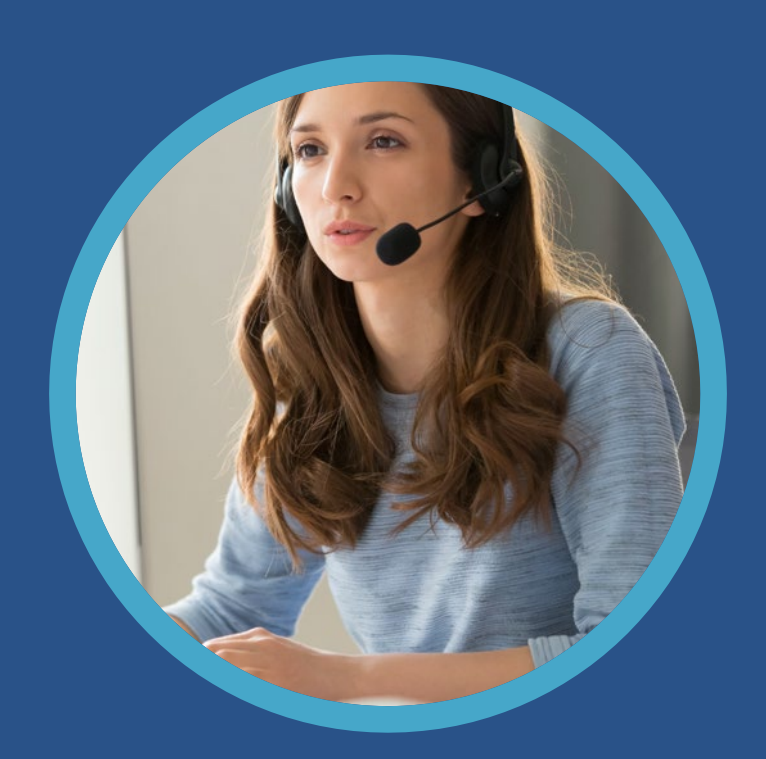
Call Center Customer Service